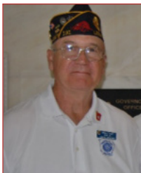
Harlie Treat Commissioner