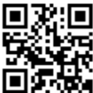
UCA Campus Map